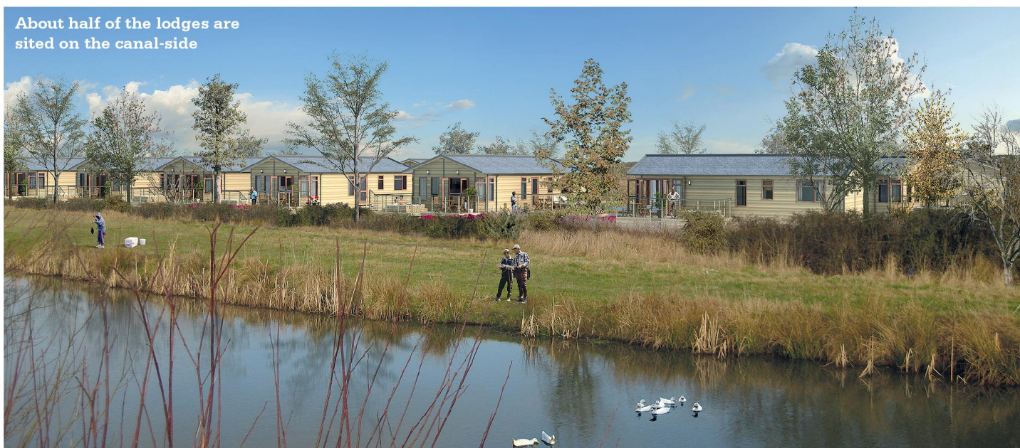
About half of the lodges are sited on the canal-side