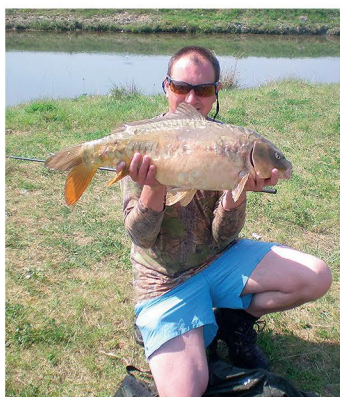
ABOVE This fish was caught in the canal that flows past Ashby Woulds park

And if a dip in the hot tub on the deck doesn't fully relax Ashby Woulds guests, a telephone call will bring a