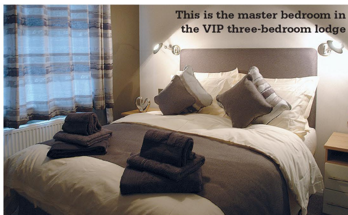
This is the master bedroom in the VIP three-bedroom lodge

qualified therapist to their lodge to provide a private beauty or health treatment.